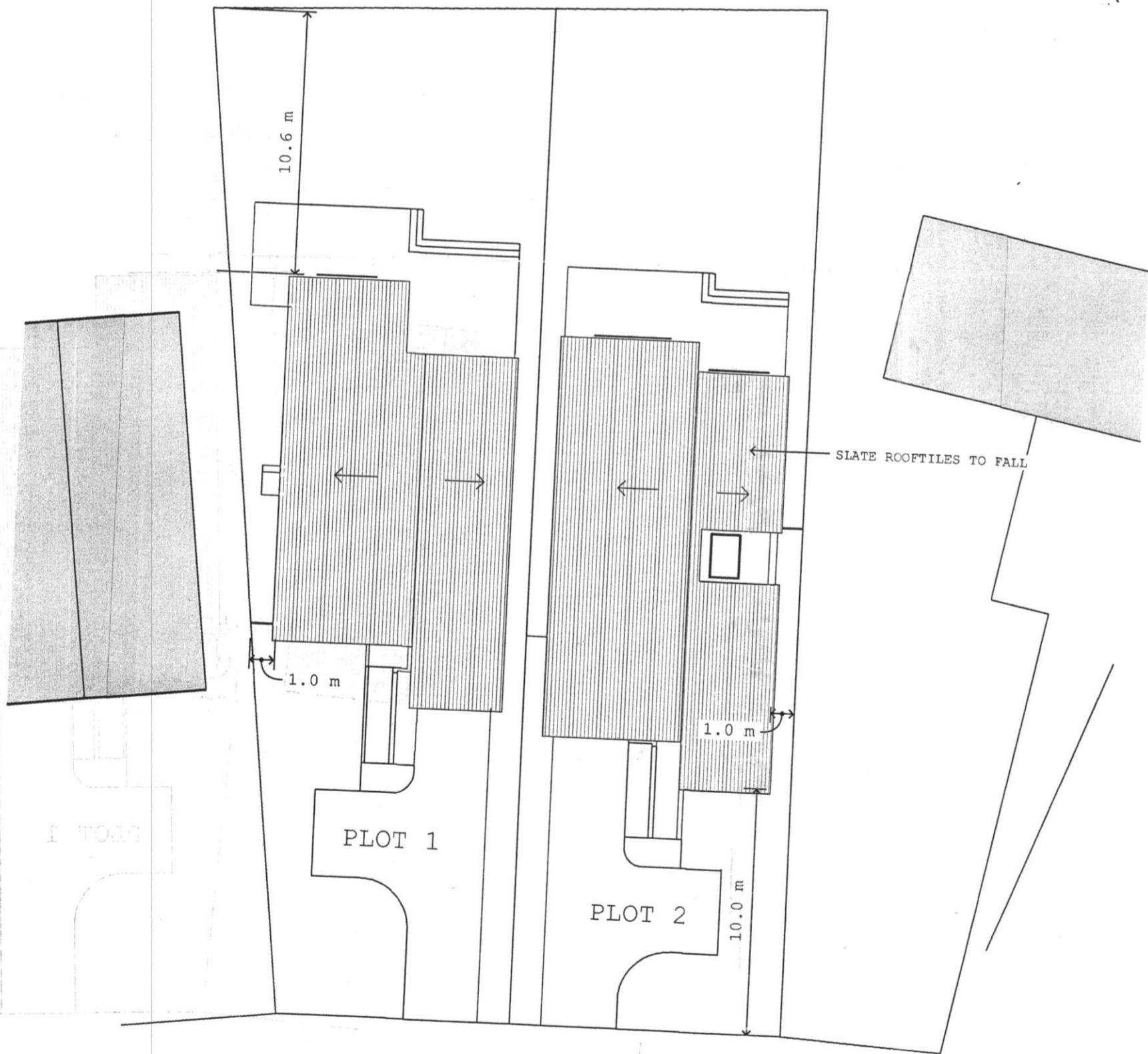
3 ROOF PLAN / SITE PLAN. 1800/03 Scale: 1:200